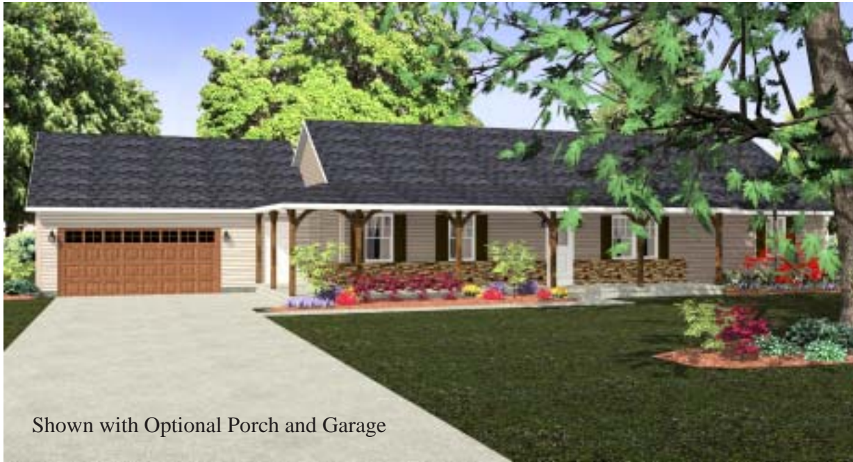
Shown with Optional Porch and Garage